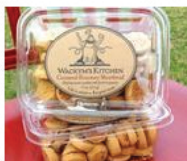
Cornmeal Rosemary S...