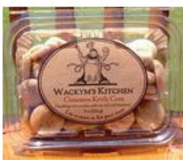
Cinnamon Kettle Cor...